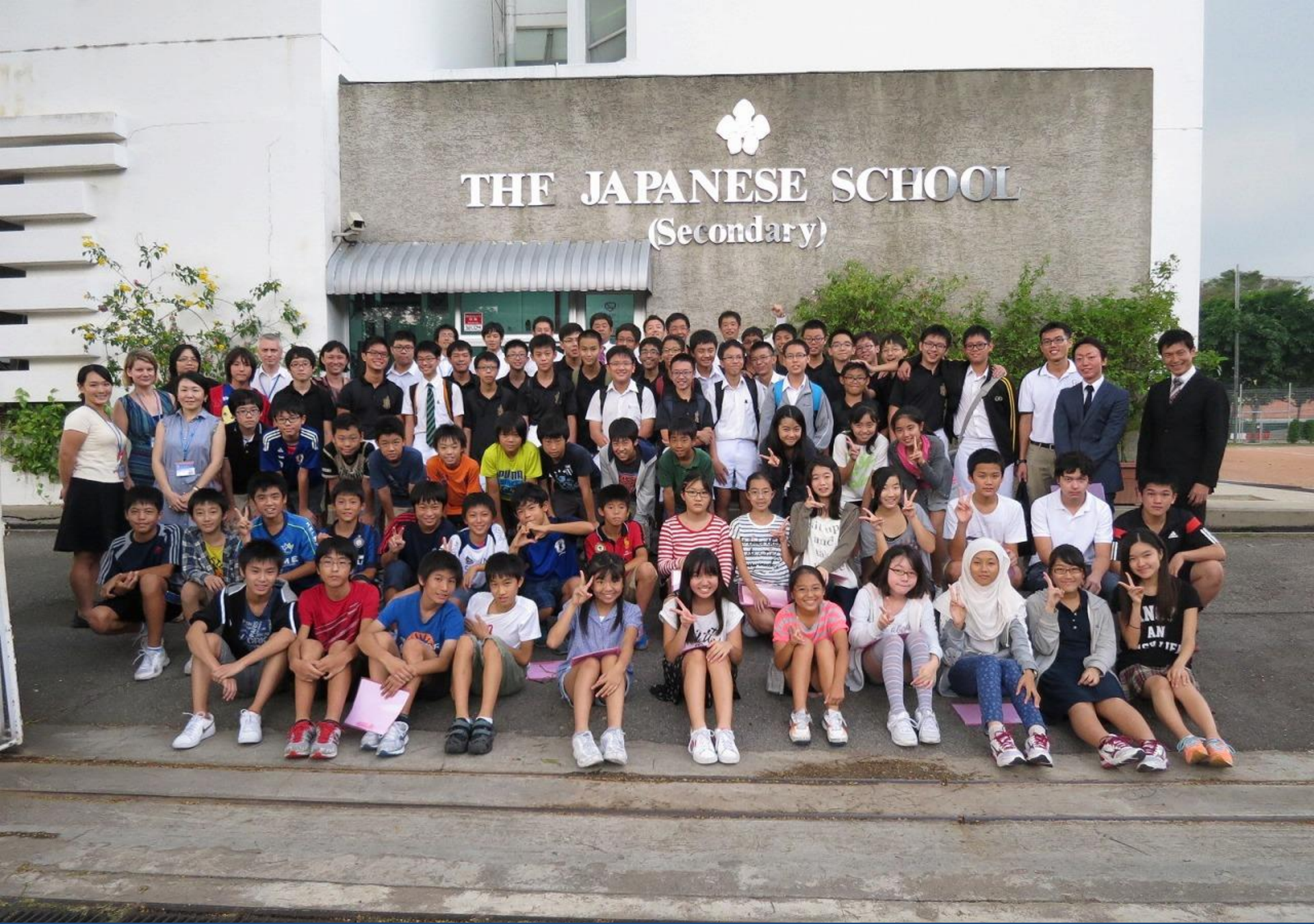
2014 September: RI visited SJSS